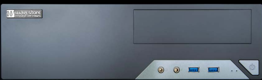
Wavestore's VMS can be installed on a host of third-party servers, or on units from Wavestore's own range. The P-Series appliance (pictured) is perfectly suited for medium-sized applications.